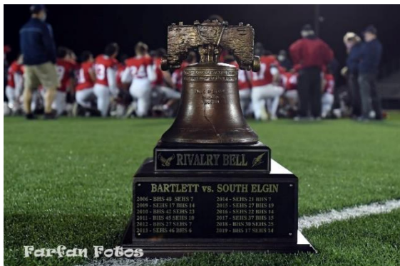
Rivalry Bell coming back home

The spring season officially ended and it ended in great fashion with our football team bringing the bell home and beating Bartlett. Our summer sports are in full swing and it is a great sight to see them all in action on a beautiful afternoon. We are grateful that we are able to let spectators come and watch our student athletes, just a reminder that every spectator has to wear a mask while on South Elgin property. Also, please remember that many of our opponents have different spectator policies, please check with your student's coach prior to the games to know what those policies are. As we near the IHSA post season play, please be aware that all post season games will have an admission fee, and that will be communicated out on how much that is prior to the games. For our underclassman please be aware the summer camp registration will open soon. All registration and information can be found on our athletic website. Please make sure you follow our athletic department and teams on Twitter and Instagram, the athletic department is @sehssports. As always, check out the athletic website for the latest information on the SEHS Athletic teams and as always ROLL STORM!