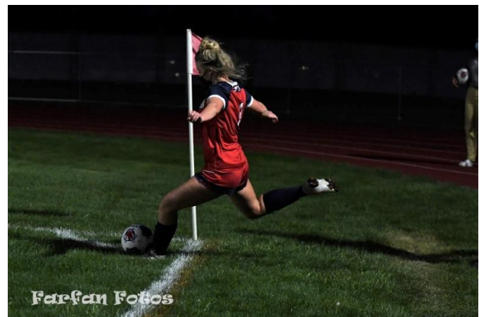
Our girls' soccer team is off to a 4-0 start, and playing games at SEHS for the first time since 2018.