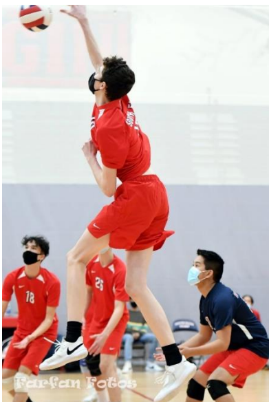
Boys Volleyball in their first home match since 2019.